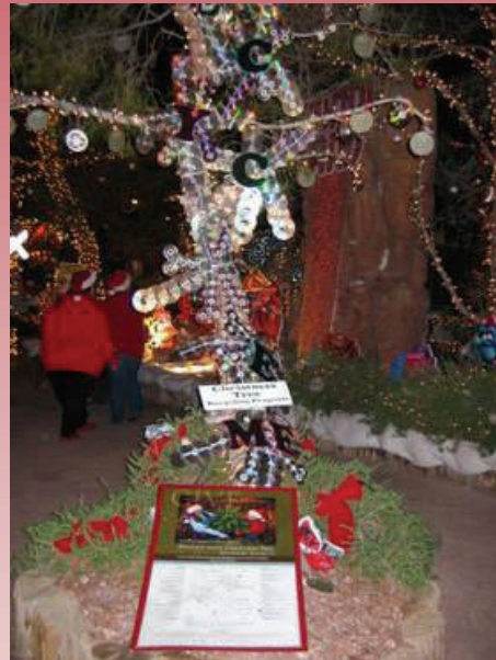
Magical Forest Tree at Opportunity Village

The Christmas Tree Recycling Committee, composed of local government agencies, nonprofits and business, has worked to keep Christmas trees out of Southern Nevada's local landfills for the past seven years. Recycling your tree helps ensure the sustainability of our community by saving valuable landfill space. When chipped into mulch, trees become valuable organic material used in landscaping projects that conserve soil moisture and keep plants healthy.