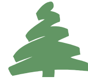
Christmas Trees Chipped 2001-2009