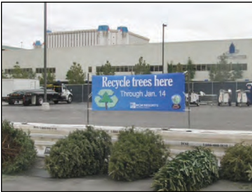
MGM Resorts employee drop-site.