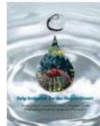
Drip Irrigation Educational Guide for residents – Partner: BOR