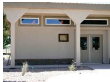
Straw Bale Structure & Demonstration Garden – Partners: CCSD, DAQEM, Mesquite / Overton