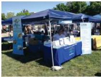
CDSN Booth at GreenFest