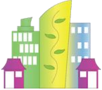
Zion Garden Park Agricultural Assistance Program