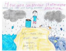
10 th Annual Stormwater Pollution Poster Contest – Partners: CCSD, LVVWD, NDEP