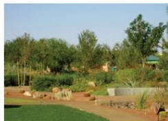
Acacia Demonstration Garden Partners: City of Henderson